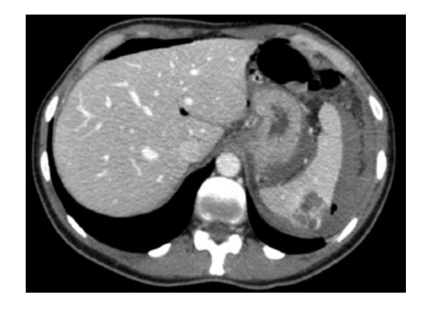
Fig. 2. Computerized tomography scan, heterogeneous hypervascular mass at the superior splenic pole.