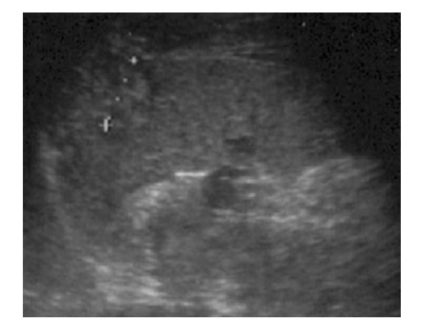
Fig. 1. Abdominal ultrasound (US), mass at the superior splenic pole.

A laparoscopic total splenectomy was performed.